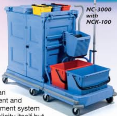
NC-3000 with NCK-100