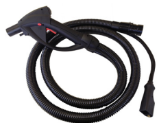
2.5 Metre Steam, Detergent & Vacuum Hose