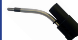
Short Steam Lance