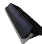
Clip On Squeegee 15RM00042