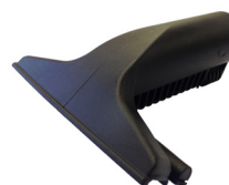
150mm Steam & Vacuum Brush Nozzle