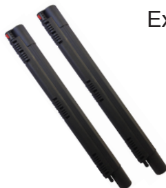
Extension Tubes x 2 supplied with each machine