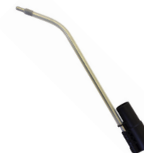
Long Steam Lance